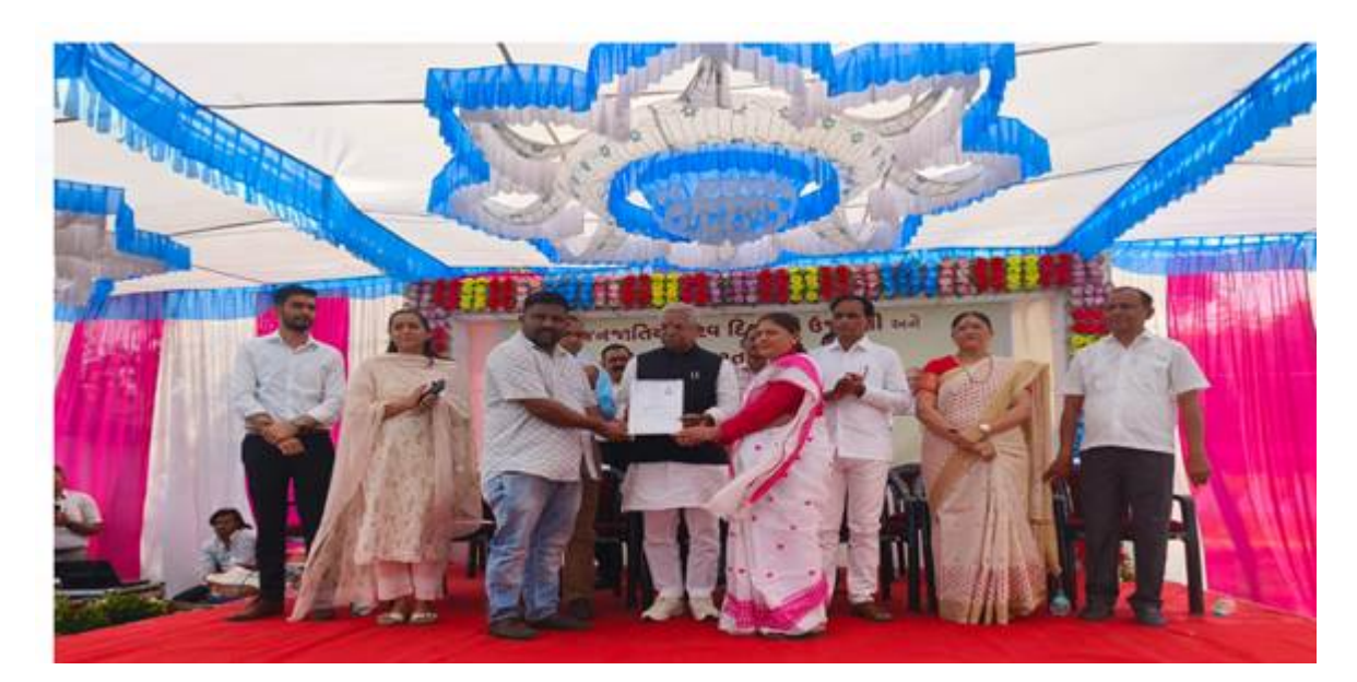
Abhinandan Patra distribution in Waghai Village, District Dang of Gujarat