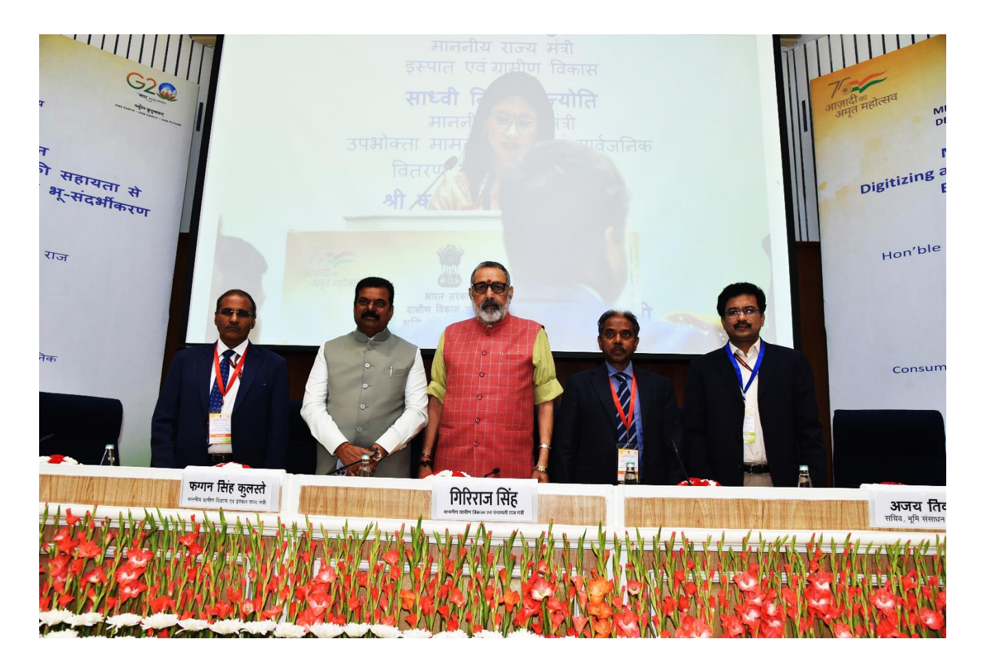
ULPIN Rollout by States