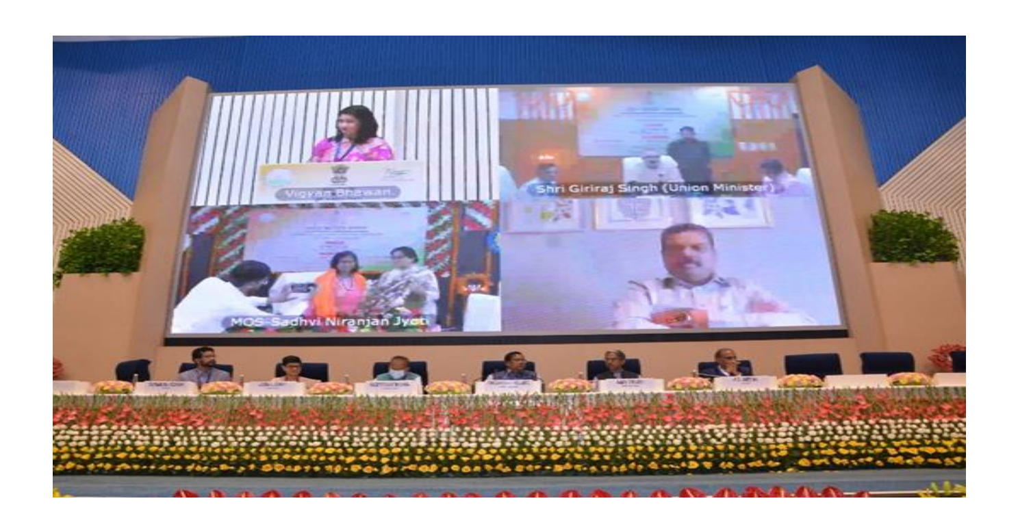
Bhumi Samvaad: National Conference on Digitizing and Georeferencing India with Bhu-Aadhaar (ULPIN)